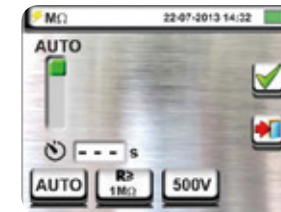
Selection of AUTO or TIMER measuring mode